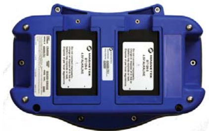
Main battery and spare battery packs