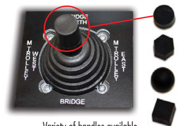
Variety of handles available